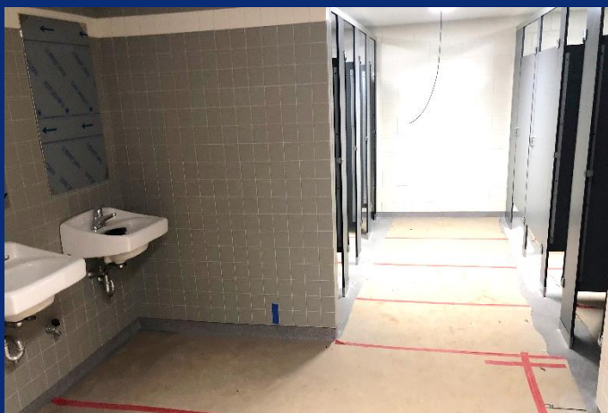
Toilet Partitions Installed Lower Level Restrooms