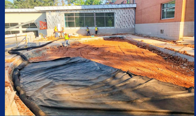
Hardscapes South Playground