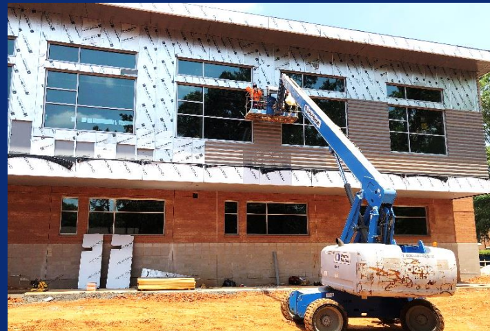
East Wing Metal Paneling in Progress