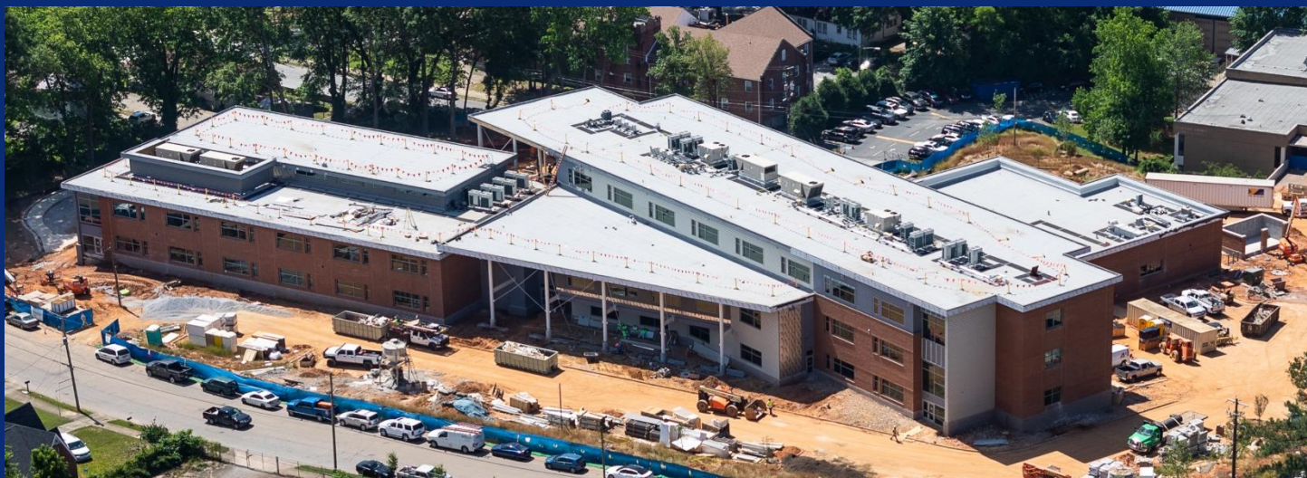
Aerial view of project from Northside