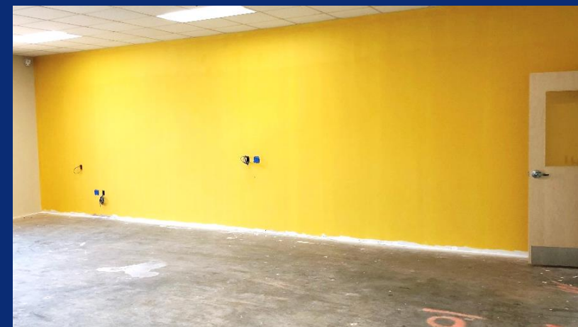
First coat final Paint 2 nd floor classrooms