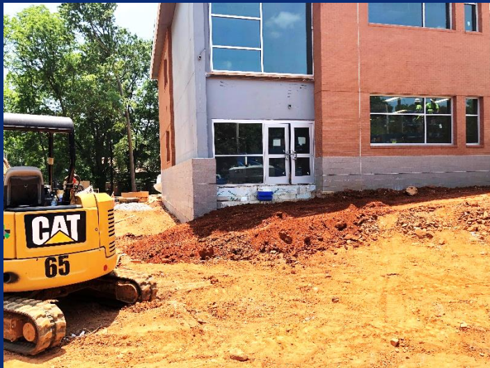
Grading Outside East Wing Stair in Preparation for Northeast Concrete Stair Install