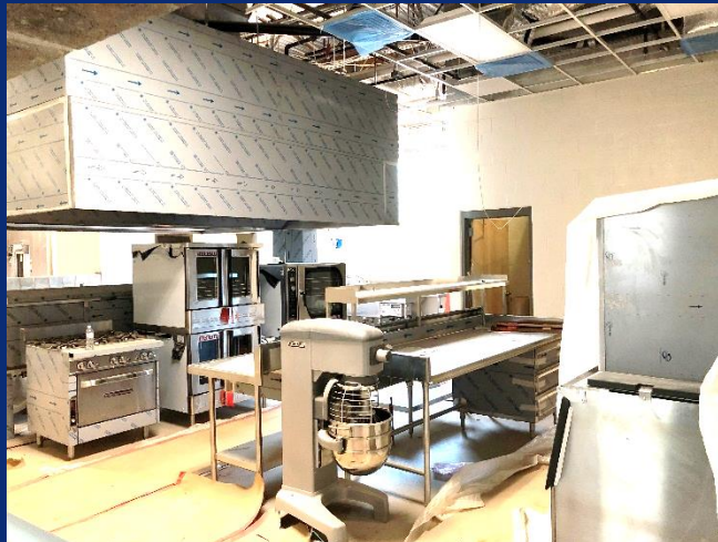
Kitchen Equipment and Prep for Ceiling installation