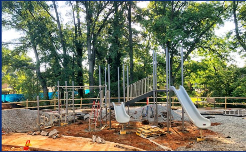
North Playground Installation in Progress