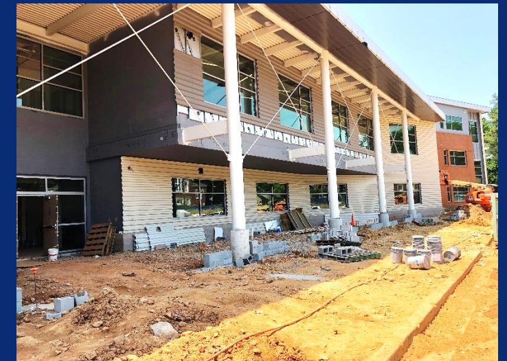
North Entrance Seat Wall CMU Installation