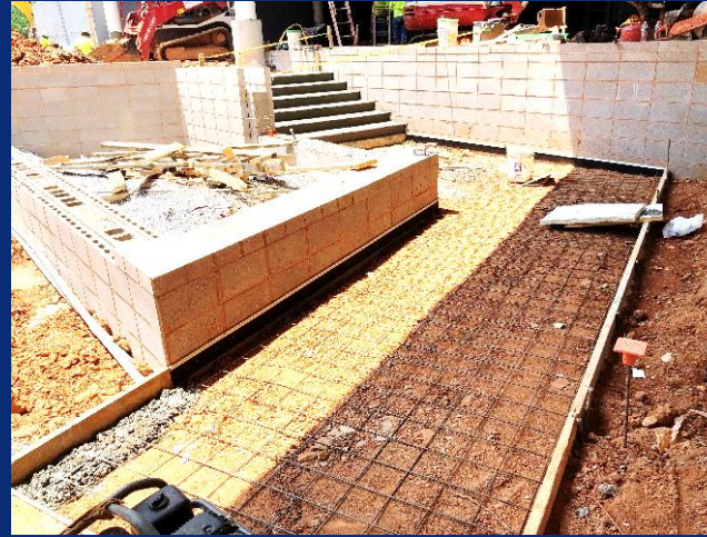
Stairs and Sidewalk Hardscapes at East-Side Terrace